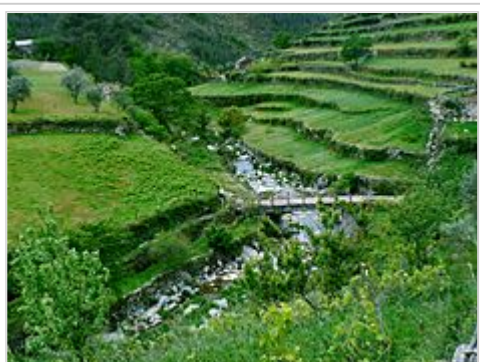
A bridge over a ravine in Loriga, with the pastures of the valley landscape

Known locally as the " Portuguese Switzerland " due to its landscape that includes a principal settlement nestled in the mountains of the Serra da Estrela Natural Park. [2] It is located in the south-central part of the municipality of Seia, along the southeast part of the Serra, between several ravines, but specifically the Ribeira de São Bento and Ribeira de Loriga; [2] it is 20 kilometres from Seia, 80 kilometres from Guarda and 300 kilometres from the national capital (Lisbon). A main village is accessible by the national roadway E.N. 231, that connects directly to the region of the Serra da Estrela by way of E.N.338 (which was completed in 2006), or through the E.N.339, a 9.2 kilometre access that transits some of the main elevations (960 metres near Portela do Arão or Portela de Loriga, and