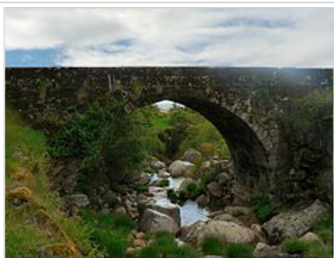
The remaining Roman-era bridge crossing the Ribeira de Loriga

Loriga was founded originally along a column between ravines where today the historic centre exists. The site was ostensibly selected more than 2600 years ago, owing to its defensibility, the abundance of potable water