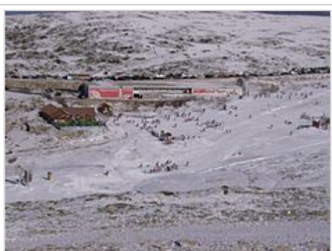
Vodafone Ski Resort, Serra da Estrela, in Loriga.

Textiles are the principal local export; Loriga was a hub the textile and wool industries during the mid-19th century, in addition to being subsistence agriculture responsible for the cultivation of corn. The Loriguense economy is based on metallurgical industries, bread-making, commercial shops, restaurants and agricultural support services.