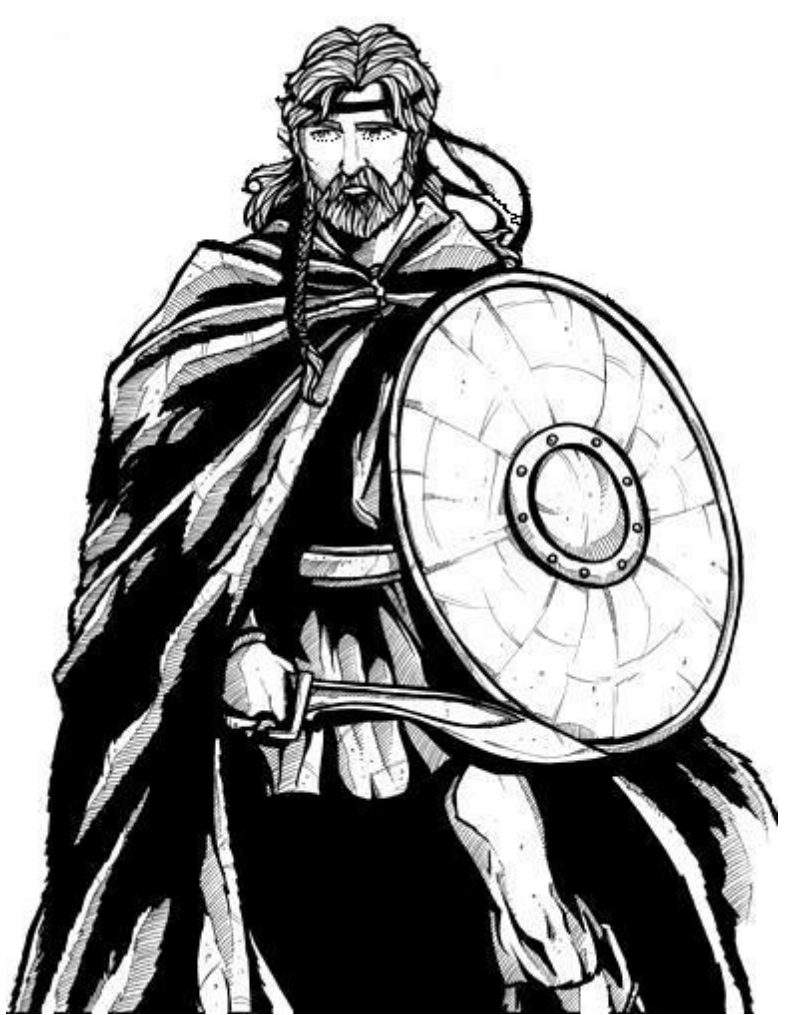
Viriathus - Portuguese national hero.